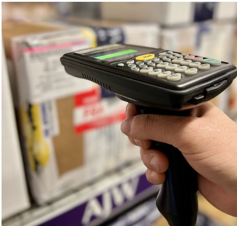
Leveraging digital technologies can help the industry overcome common time-related challenges.

Digital transformation helps to streamline the supply chain with tools such as dynamic pricing models, procurement forecasting, blockchain, and RFID (radio frequency identification) tracking. Macpherson says by using these tools at the MRO facility at AJW