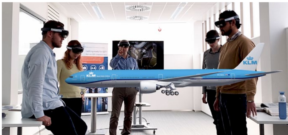
Digital training innovations are increasingly vital in training programmes.