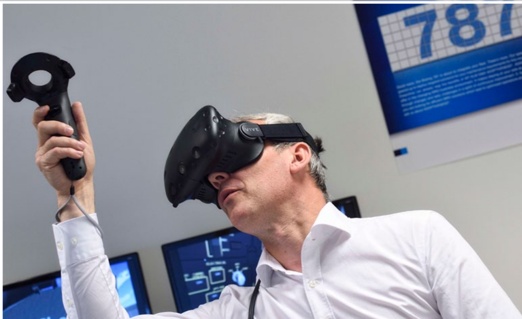
VR has become a major component to improve the quality and efficiency of training.